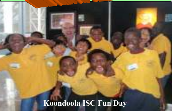
Koondoola ISC Fun Day

During the July school holidays, students who were due to exit the ISC Program at Koondoola were taken to the Edmund Rice Centre Mirrabooka for a fun cooking day. The first item on the menu was an entree of fruit skewers which were followed by a main course of self-made pizzas and vegetable muffins. Their cooking experience finished with popcorn snacks. The day was thoroughly enjoyed by all participants who wanted a