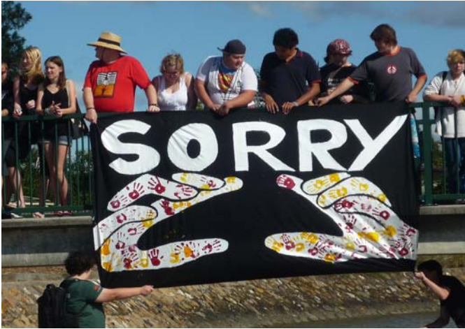
(Staff and students from Deception Bay FLC at the local bridge)