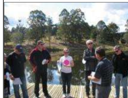
Some of the 10th New Street Revisited group in 2011 wait to share their action plan commitment as part of the closing ritual.