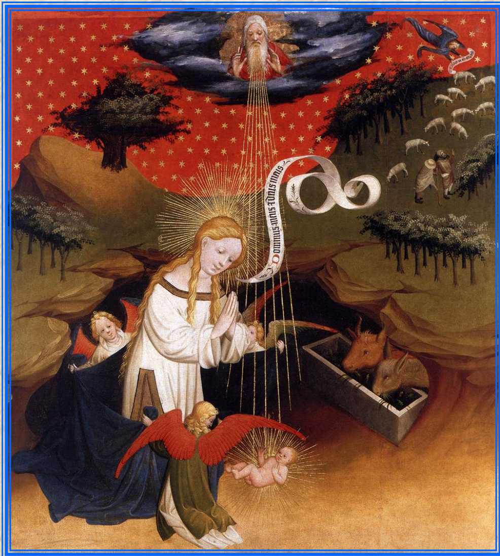
MASTER FRANCKE, Birth of Jesus, Kunsthalle, Hamburg