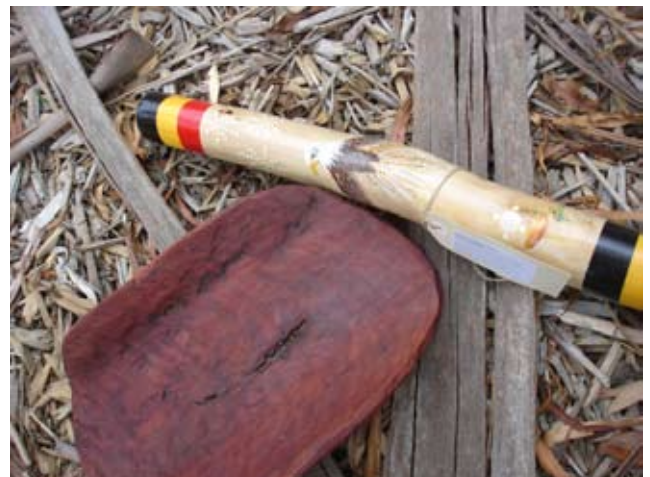
Below: The Amberley Message Stick and Coolamon

Watch this space as there are some great opportunities coming up!!