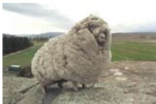
Sorry mate I couldn't resist!